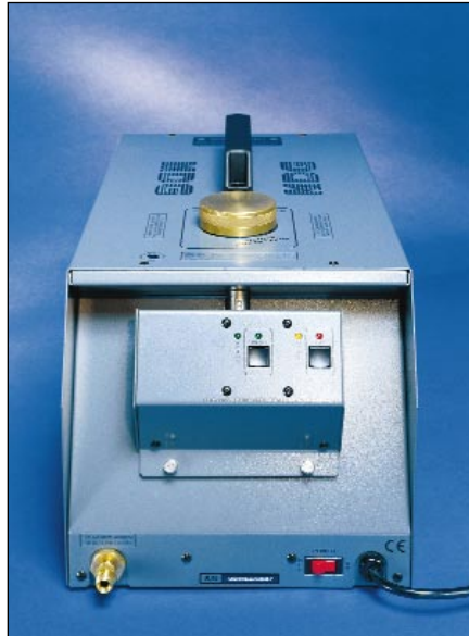
Back Panel and Remote control

Safe and easy to use for continuous or momentary emission of fog. Comes with an 8 m (25 ft) 5 pin XLR control cable extension. Cable may be acquired up to 100 m (325 ft).