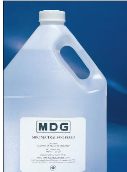
MDG Neutral Fluid

Remote Control Timer and 2 channel DMX Interface