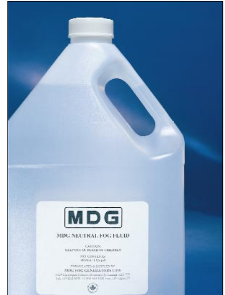
MDG Neutral Fluid

Remote Control Timer and 2 channel DMX Interface