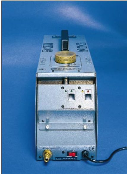
Back Panel and Remote control

Safe and easy to use for continuous or momentary emission of fog. Comes with an 8 m (25 ft) 5 pin XLR control cable extension. Cable may be acquired up to 100 m (325 ft).